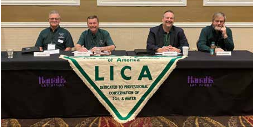
LICA National Board of Directors