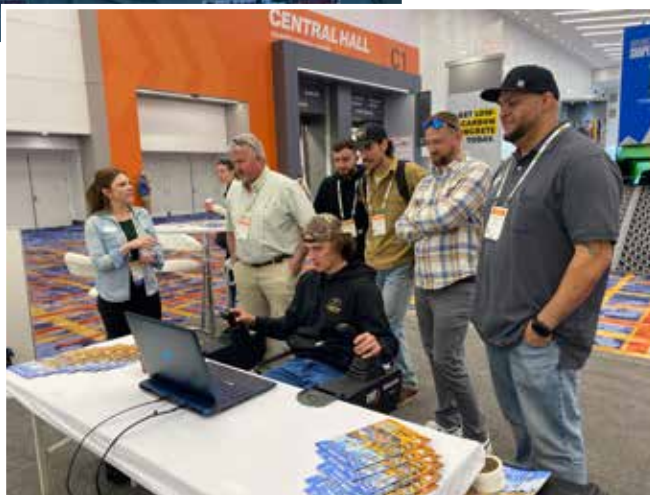
LICA Booth at ConExpo